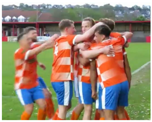
From top: the Men's Reserves after winning the League Cup, the First Team celebrating their leaguewinning goal